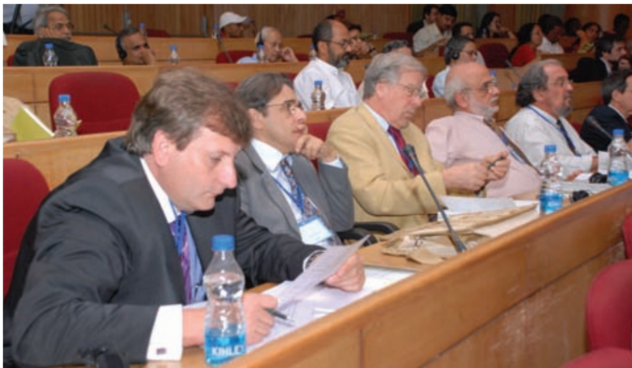
Members of the conference delegation from Brazil

and towards expenditures on public goods like agricultural research and rural roads (e.g. in India), supporting smallholders and family farms in less-favoured areas, policies to reduce rural–urban disparities (e.g. fiscal stimulus focusing on rural areas), and further reforms in land and land-use ownership (e.g. China).